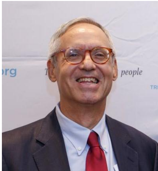
Paul Samuels Legal Action Center